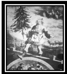
Christmas Cards and artwork depicting the wild mischievous actions of young and old when celebrating the Holiday.