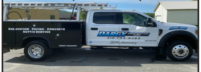
Darcy Construction Corporation

Did you know that we’re on Facebook? Check us out! You’ll see what’s new at the Heritage Center and hear about the latest events, programs and other happenings. Let us know what you like and what you would like to see. Be sure to give us a “like” and we don’t mind if you “share”.