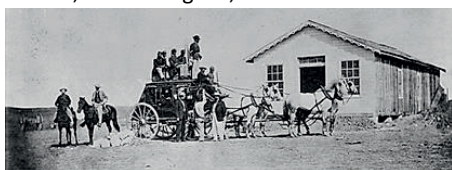
National Archive photo of Buffalo Soldiers guarding a stagecoach.