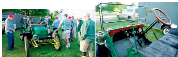
An Outdoor Historical Society Meeting June 6 showing the Steam Automobile.