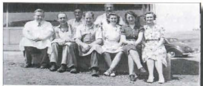
Employees of Sykes Store, 1942