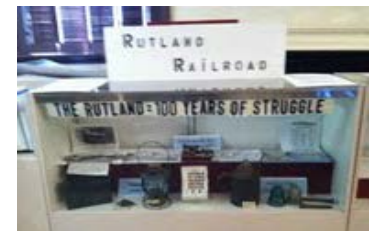
Rutland Railroad Display