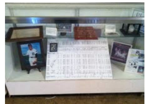
Elroy Face, Baseball Player Display