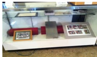
Various Displays at Heritage Center on Stephentown history and historians.