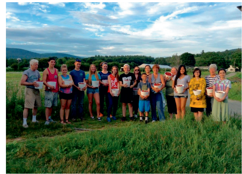
Young Volunteer Strawberry Pickers