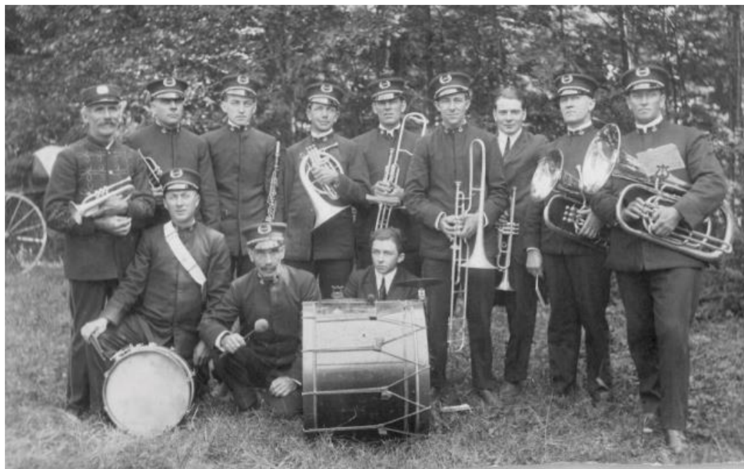
Stephentown Brass Band