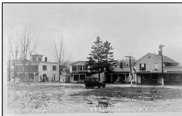
Vanderbilt House in 1907